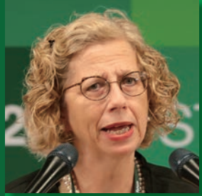
Inger Andersen Under-Secretary-General UNITED NATIONS