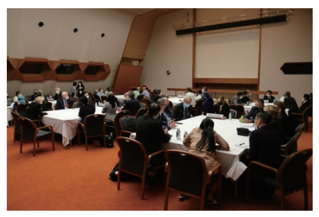
Concurrent Session "Big Data (Opportunities and Risks)" (2022)